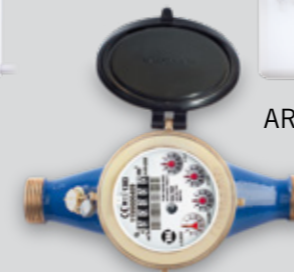
DS TRP DS SD getto multiplo multi jet