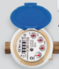
CD ONE TRP getto unico single jet