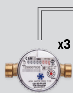
CD SD PLUS getto unico single jet