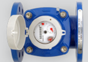
WMAP evo woltmann