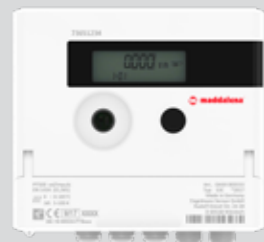
MICROCLIMA S3C unità elettronica calculator