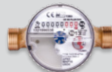
CD SD EVO getto unico single jet