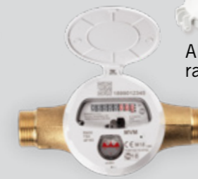
MVM MVM PLUS C volumetrico volumetric